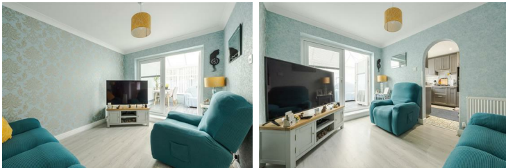
Dining room 11'7" x 9'0" (3.55 x 2.76)