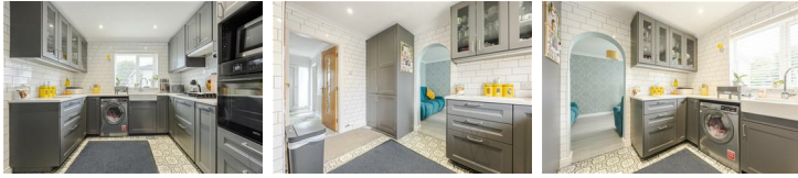
Kitchen 11'7" x 9'8" (3.55 x 2.97)