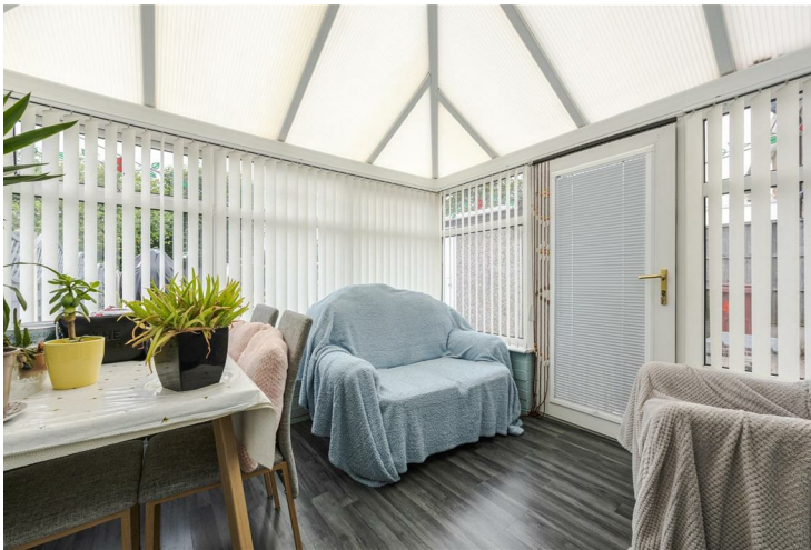
Sun room 10'1" x 9'7" (3.09 x 2.94)