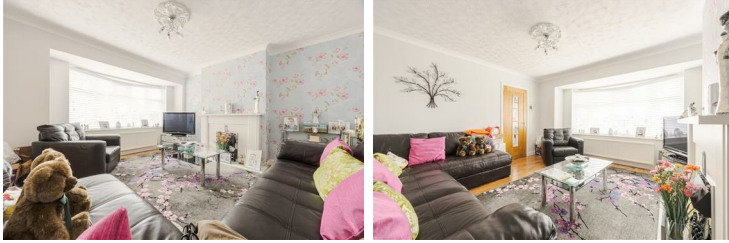
Lounge 14'3" x 12'9" (4.36 x 3.90)