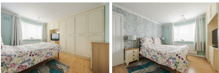
Bedroom one 12'5" x 11'7" (3.80 x 3.55)