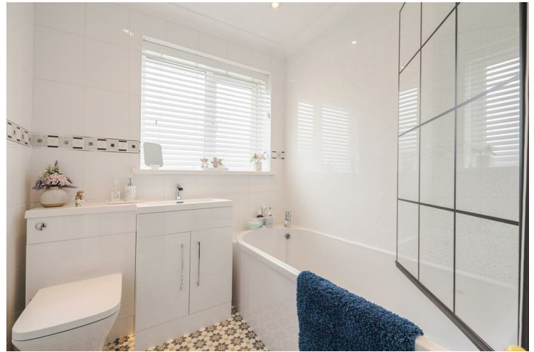
Bathroom 6'3" x 6'3" (1.93 x 1.93)