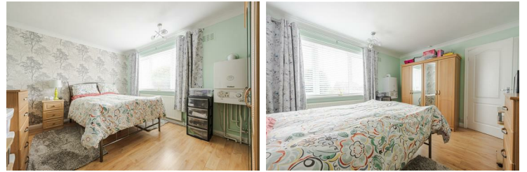
Bedroom two 12'4" x 9'5" (3.78 x 2.88)